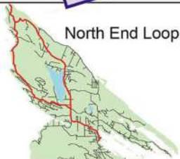
North End Loop

Rating: 2 (a,b,c) Distance: 29 km/18 mi Duration: 2 hr Route Odometer Ganges to St Mary Lake.....5.5 km North End Rd to Vesuvius Bay Rd..... 19.5 km Vesuvius Bay Rd to Ferry...20.5 km Ferry to Upper Ganges Rd...24.5 km Upper Ganges Rd to Ganges ..... 29 km Hills ↑ Golf Course Hill..... 4 km ↑ Southey Hairpin.....12 km ↑↓Sunset Hill.....18 km ↓Upper Ganges Rollers..... 25 km