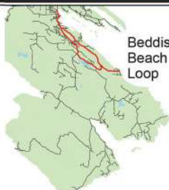
Beddis Beach Loop

Rating: 1 (c) Distance: 13 km/8 mi Duration: 1 hr Route Odometer Ganges to Robinson Rd..... 0.5 km Robinson Rd to Long Harbour Rd .....1.5 km Long Harbour Rd to Old Scott Rd.....4 km Old Scott Rd to Welbury Rd ..... 6 km Welbury Rd to Long Harbour .....7 km Long Harbour to Ganges.....13 km Hills ↑ Hastings Hill.....0.75 km ↑↓Long Harbour Hill .....2 km ↓Scott Rd rollers.....6 km