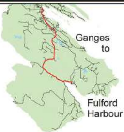
Ganges to Fulford Harbour

Rating: 1 (a,c) Distance: 21 km/13.1 mi Duration: 1 hr 30 min Route Odometer Upper Ganges to Beddis Rd ..... 1.3 km Beddis Rd to Beddis Beach ... 8.5 km Beddis Beach to Cusheon Lake Rd ..... 11 km Cusheon Lake Rd to Lower Ganges Rd ..... 16 km Lower Ganges Rd to Ganges ..... 21 km Hills ↑ 1/2 Ganges Hill ..... 0.5 km ↑↓Beddis Beach Bump ..... 8.5 km ↓Ganges Hill..... 19 km