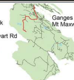
Ganges to Mt Maxwell

Rating: 2 (a,b,c,d) Distance: 17.7 km/11 mi Duration: 1 hr 45 min Route Odometer Ganges to Beddis Rd ..... 1.3 km Beddis to Cusheon Lk Rd .....6.4 km Cusheon Lake Rd to Stewart Rd .....7.3 km Stewart Rd to Beaver Pt Rd.....10.8 km Beaver Pt Rd to Ruckle Park .....17.7 km Hills ↑ Ganges Hill ..... 0.5 km ↑ Stewart Rd Hill..... 8.3 km ↓Ruckle Park Hill..... 16 km