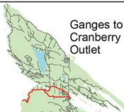
Ganges to Cranberry Outlet

Rating: 1 (c) Distance: 12.4 km/7.75 mi Duration: 1 hr Route Odometer Ganges to Baker Rd..... 3.2 km Baker Rd to Booth Bay.... 4.4 km Booth Bay to Lower Ganges...5.6 km Lower Ganges Rd to Upper Ganges Rd..... 6.4 km Upper Ganges Rd to Robinson Rd ..... 9.9 km Robinson Rd to Ganges .. 12.4 km Hills ↑ Golf Course Hill..... 2.8 km ↑↓Booth Bay .....3.2 km ↓Upper Ganges Rollers .. 10.4 km ↓Hastings Hill ..... 11.5 km