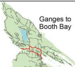
Ganges to Booth Bay

Rating: 2 (a,b,c) Distance: 29 km/18 mi Duration: 2 hr Route Odometer Ganges to St Mary Lake.....5.5 km North End Rd to Vesuvius Bay Rd..... 19.5 km Vesuvius Bay Rd to Ferry...20.5 km Ferry to Upper Ganges Rd...24.5 km Upper Ganges Rd to Ganges ..... 29 km Hills ↑ Golf Course Hill..... 4 km ↑ Southey Hairpin.....12 km ↑↓Sunset Hill.....18 km ↓Upper Ganges Rollers..... 25 km