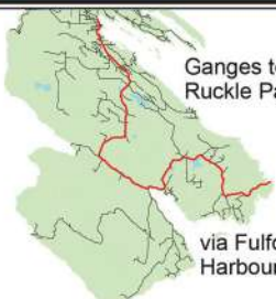
Ganges to Ruckle Park via Fulford Harbour

Rating: 2 (b,c) Distance: 14 km/8.75 mi Duration: 1 hr Route Odometer Ganges to Fulford Hbr..... 14 km Hills ↑ Ganges Hill ..... 1 km ↓Lees Hill ..... 7 km