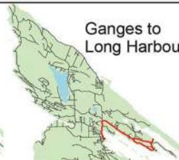
Ganges to Long Harbour

Rating: 2 (a,c) Distance: 22.6 km/14.1 mi Duration: 1 hr 45 min Route Odometer Ganges to Robinson Rd..... 0.5 km Robinson Rd to Walker Hook Rd..... 3.7 km Walker Hook Rd to North End Rd .....11.7 km North End Rd to Upper Ganges Rd ..... 18.6 km Upper Ganges to Robinson Rd .....21 km Robinson Rd to Ganges.....22.7 km Hills ↑ Hastings Hill.....0.75 km ↑↓Robinson Roller .....3 km ↓Walker Hook Hill.....4.5 km ↑North Beach ..... 11 km ↓Upper Ganges Rollers.. 19.25 km