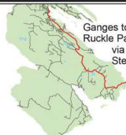
Ganges to Ruckle Park via Stewart Rd

Rating: 2.5 (a,b,c) Distance: 24 km/15 mi Duration: 2 hr Route Odometer Ganges to Beaver Pt Rd.....14 km Beaver Pt Rd to Ruckle Farmhouse ..... 19 km Ruckle Farmhouse to Campground.....20 km Hills ↑ Ganges Hill ..... 1 km ↓Lees Hill ..... 11 km ↓Hepburn Hill ..... 14 km ↓Ruckle Park Hill.....20 km